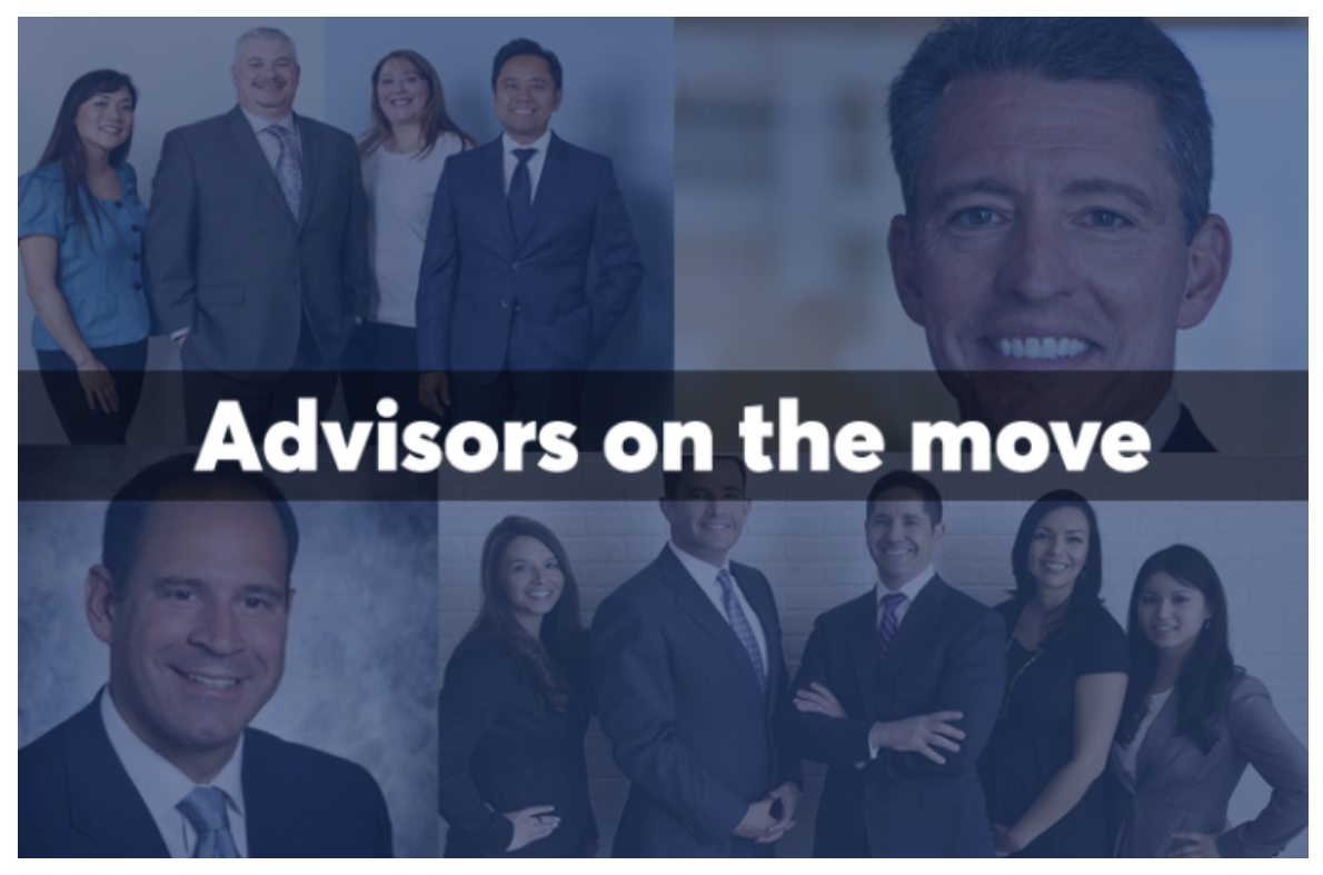
Independent and regional firms have been maintaining strong appeal with new recruits.

The protocol, which came into effect in 2004, was designed to ensure a seamless transition for advisors and their clients.